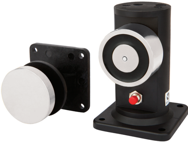
R40PCV DOOR HOLD OPEN MAGNETS FLOOR MOUNTED

The R40PCV Series devices are FLOOR mounted and come in 12VDC and 24VDC .